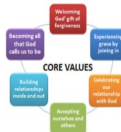
Christ Lutheran Church of Clarendon Hills Core Values